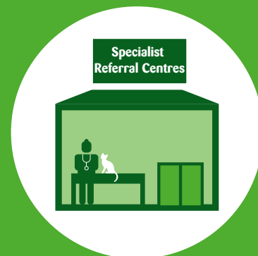
Veterinary Specialist Referral Centres