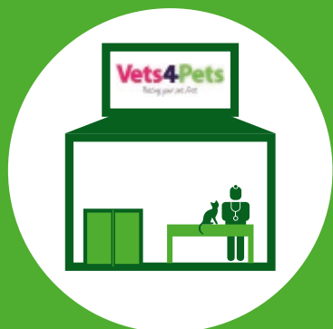
Standalone vet practices